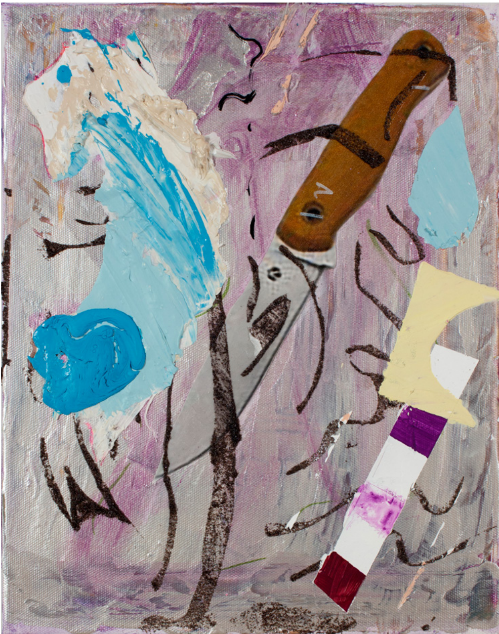
Slice and Dice , 2022 Acrylic, flashe, and inkjet on canvas 14 x 11 inches