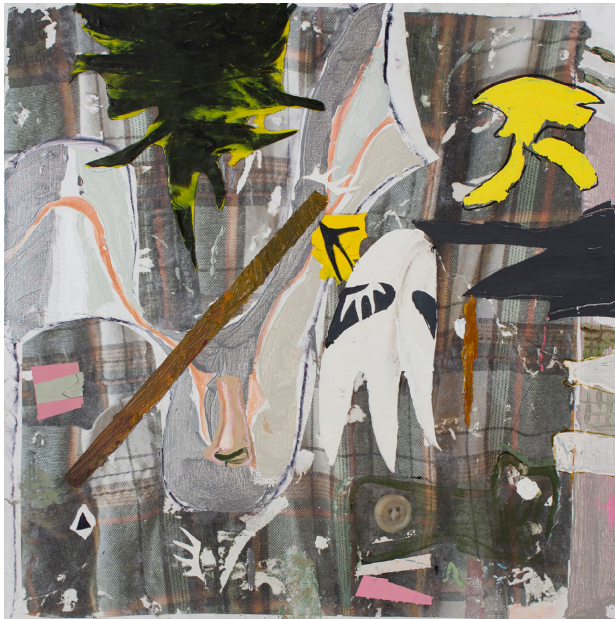
Phantoms in a Pocket , 2022 Acrylic, flashe, and inkjet on canvas 30 x 30 inches