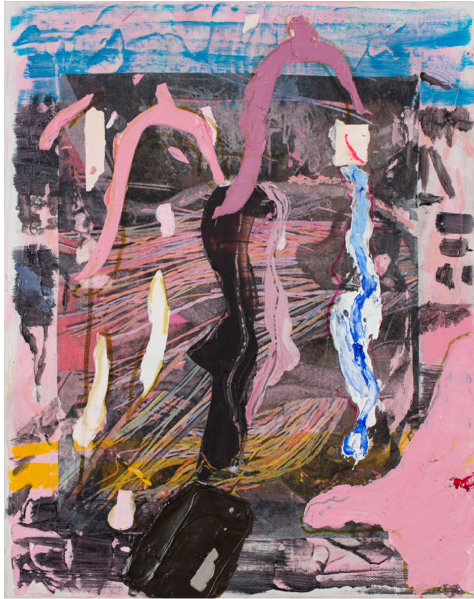
After E.M., 2022 Acrylic, flashe, and inkjet on canvas 14 x 11 inches