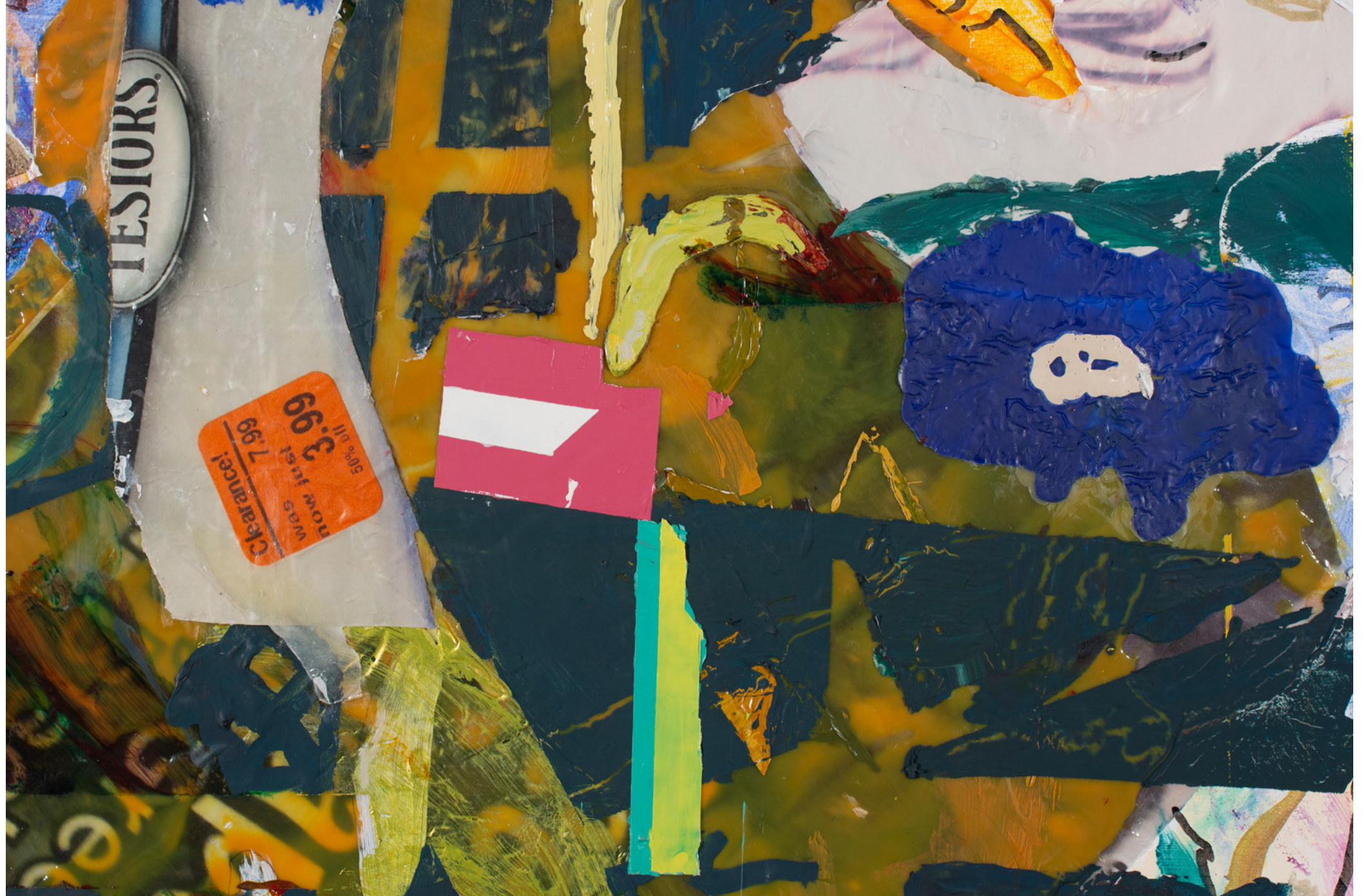
Specter in the Corner, 2022 (detail) Acrylic, flashe, and collage on canvas 48 x 44 inches