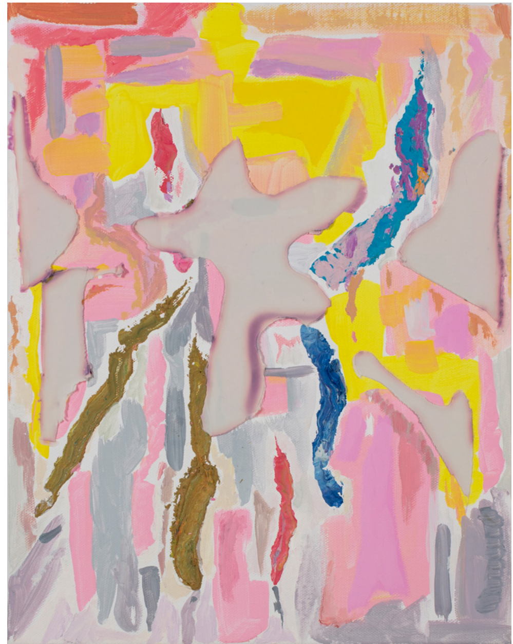
Escape , 2022 Acrylic, and flashe on canvas 14 x 11 inches