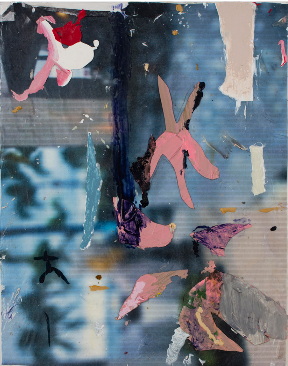
Last Holiday, 2022 Acrylic, flashe, and inkjet on canvas 14 x 11 inches