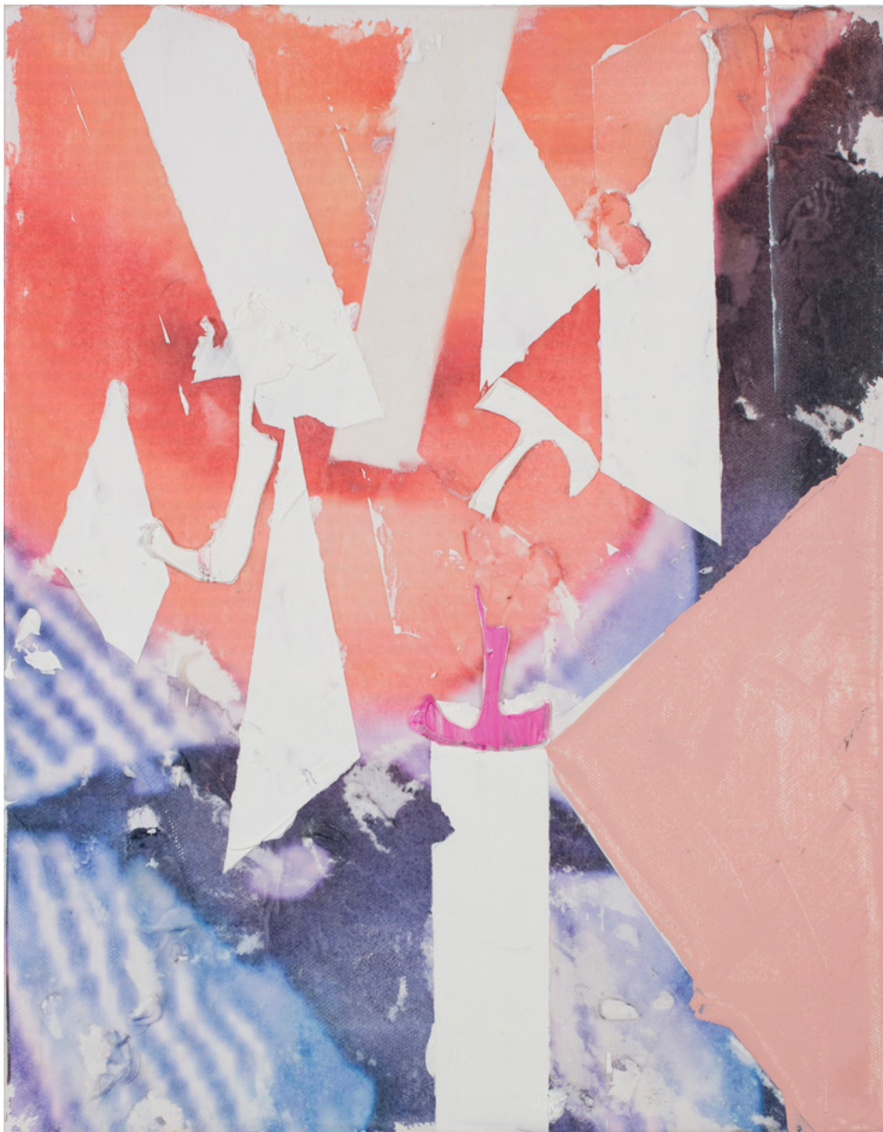
Anchor, 2022 Acrylic, flashe, and inkjet on canvas 14 x 11 inches