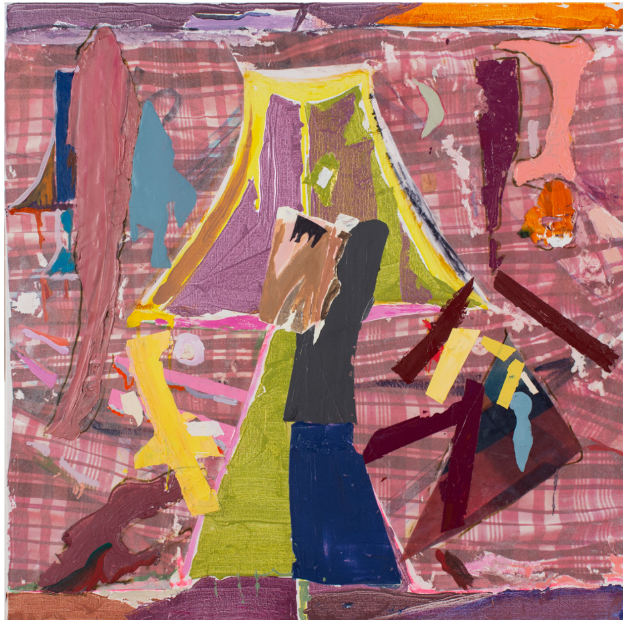
Broken Read , 2022 Acrylic, flashe, collage, and inkjet on canvas 30 x 30 inches