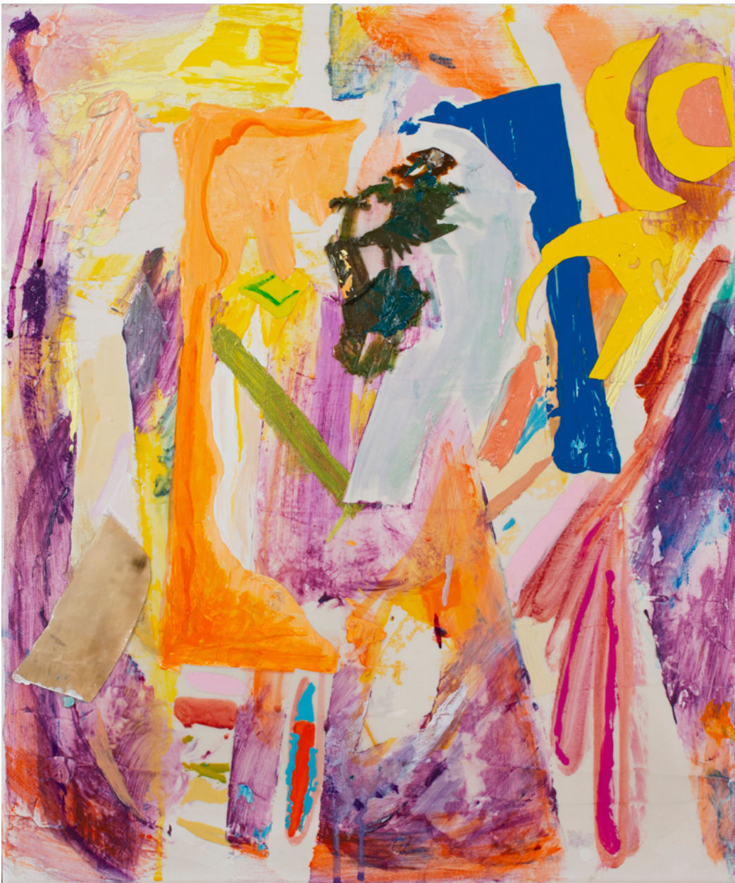
Hangman, 2022 Acrylic, flashe, and collage on canvas 20 x 16 inches