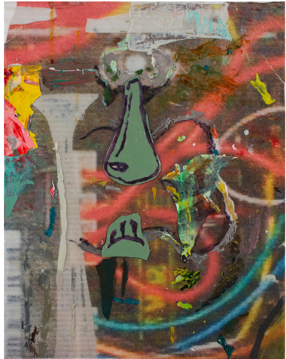
Partial Resemblance , 2022 Acrylic, flashe, and inkjet on canvas 14 x 11 inches