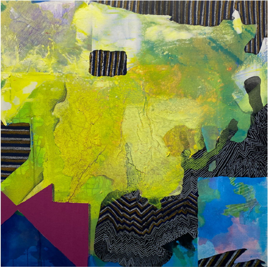
Finding Space #5, 2023 Acrylic, crayons, flashe and paper on canvas 40 x 40 inches