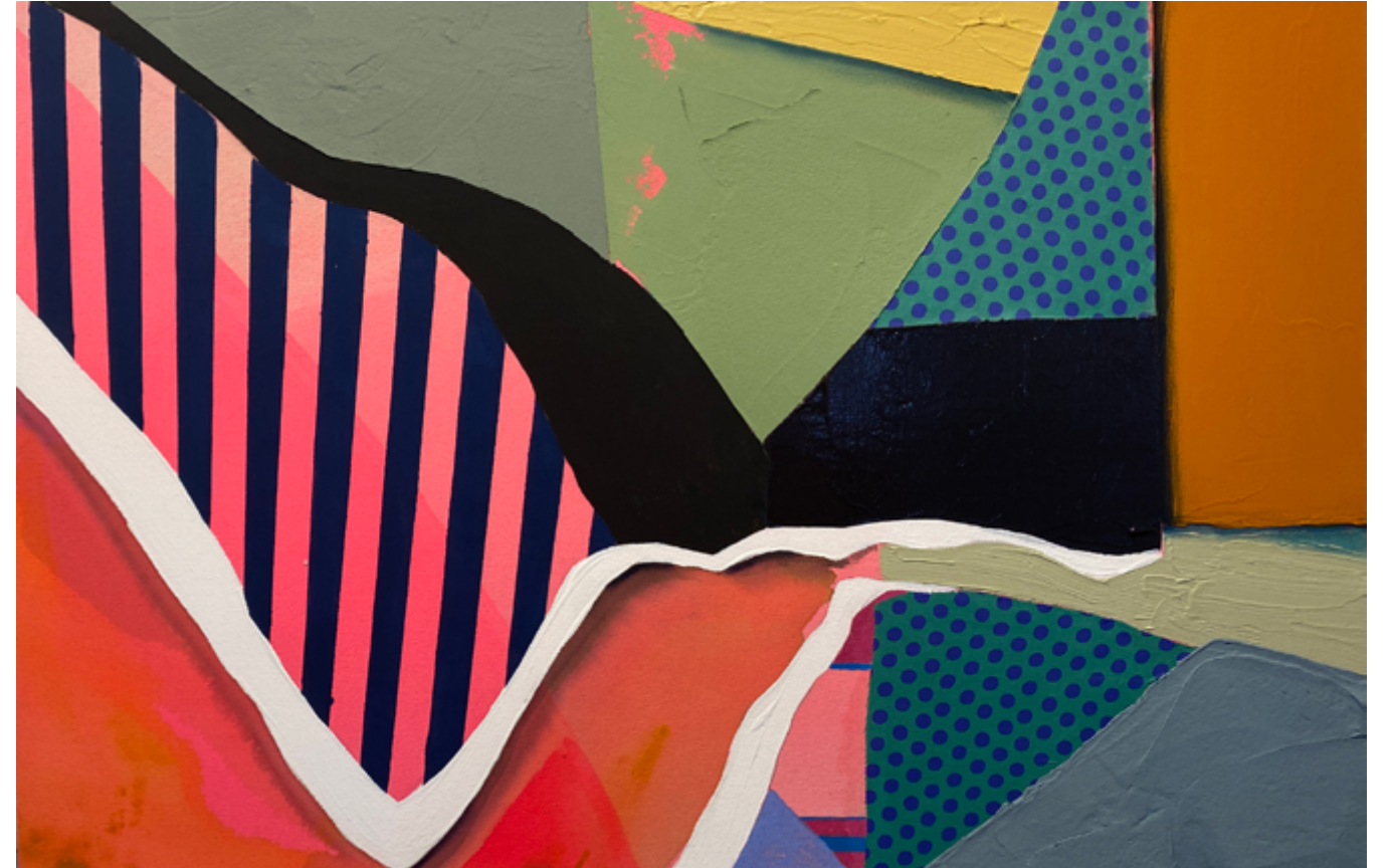
Ineffable Patterns #18, 2022 Acrylic, gesso and crayon on canvas 24 x 36 inches