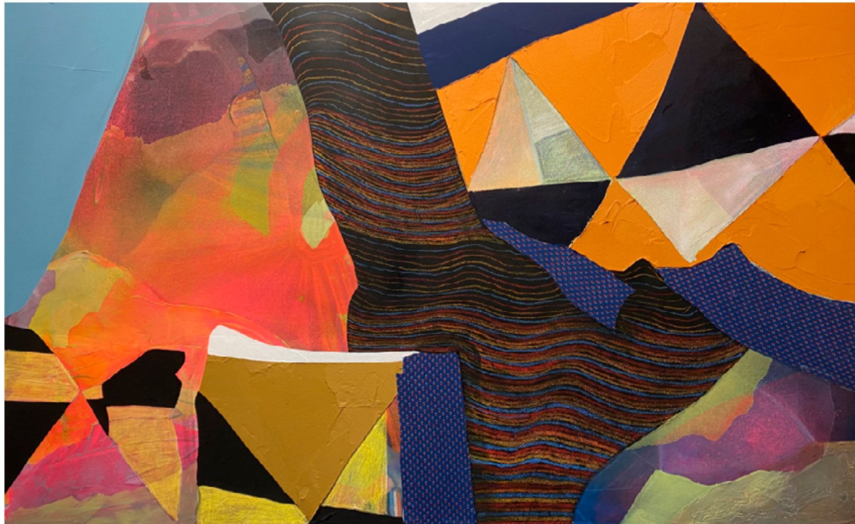
Ineffable Patterns #14, 2022 Acrylic, fabric, crayon, gesso, and flashe on canvas 42 x 40 inches