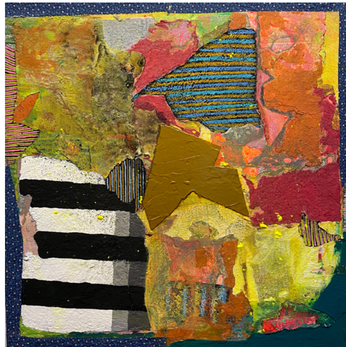
Finding Space #1, 2023 Acrylic, markers, crayons, flashe, paper and fabric on canvas 20 x 20 inches