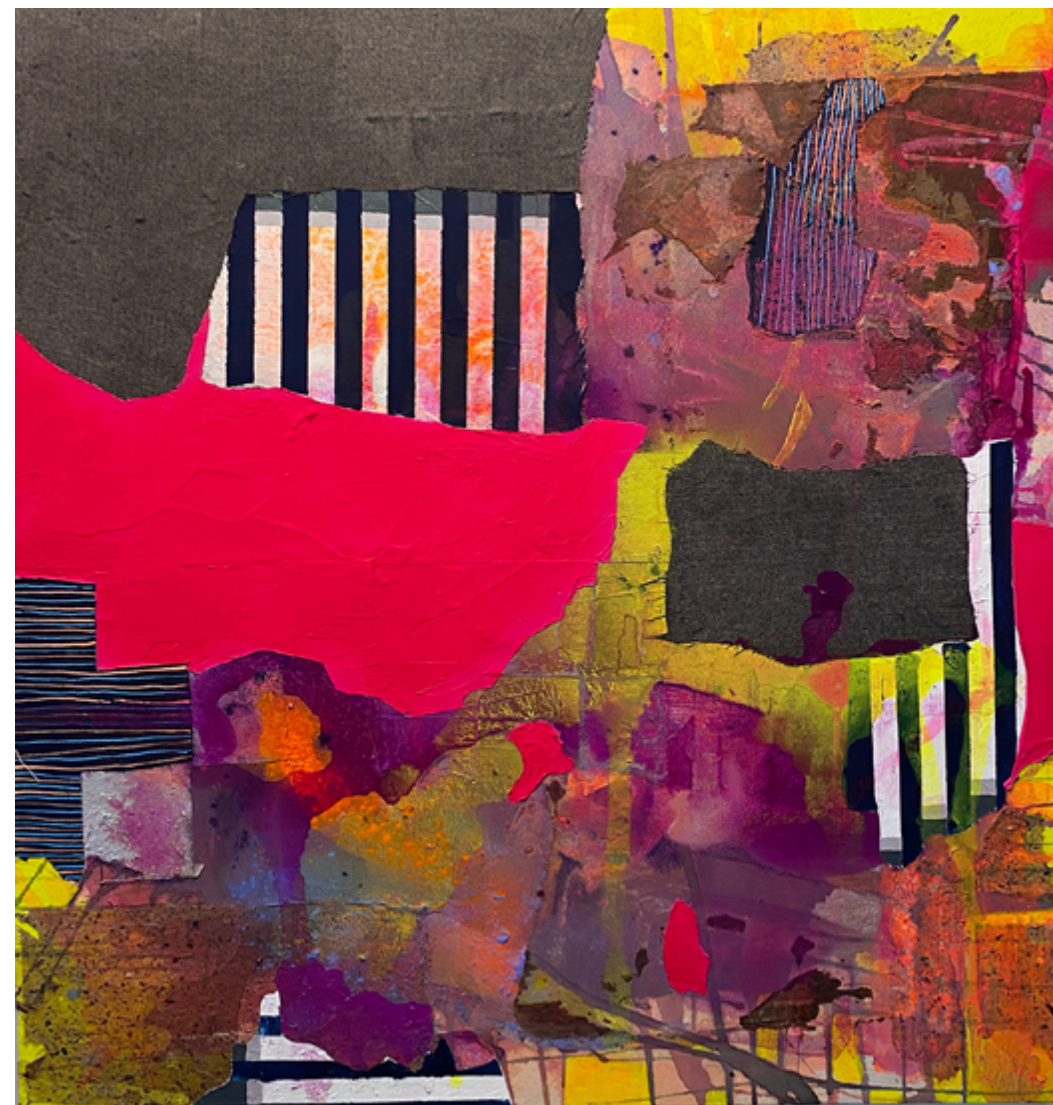
Finding Space #6, 2023 Acrylic, markers, crayons, flashe, paper and fabric on canvas 42 x 40 inches