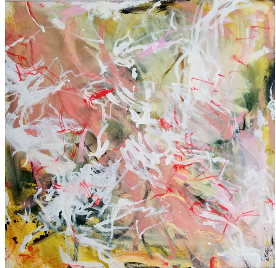
Flower Scribble 2, 2020, Oil on canvas, 24" x 24"