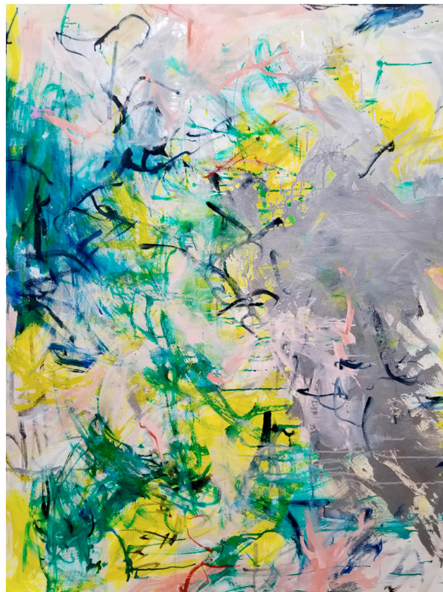
Room of Light , 2021, Oil on canvas, 48" x 36"