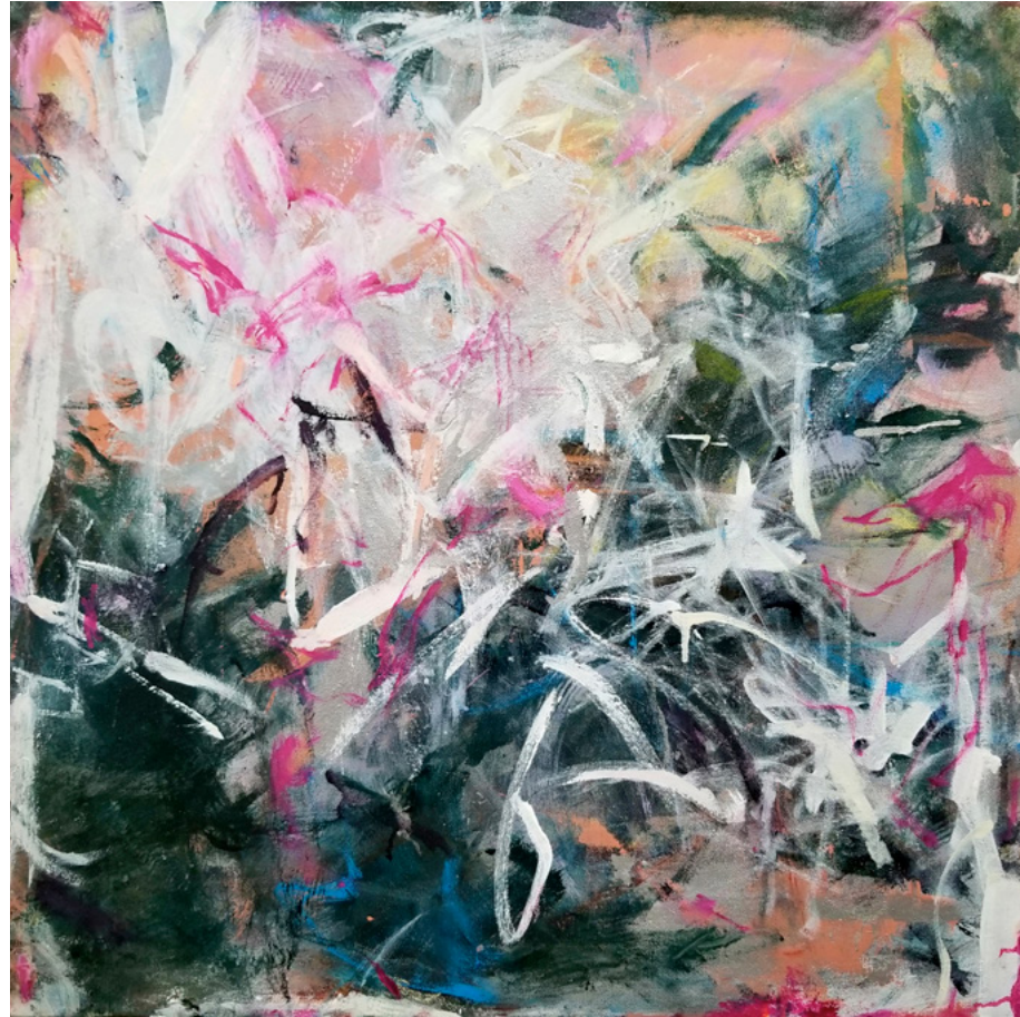
Flower Scribble 1, 2020, Oil on canvas, 24" x 24"