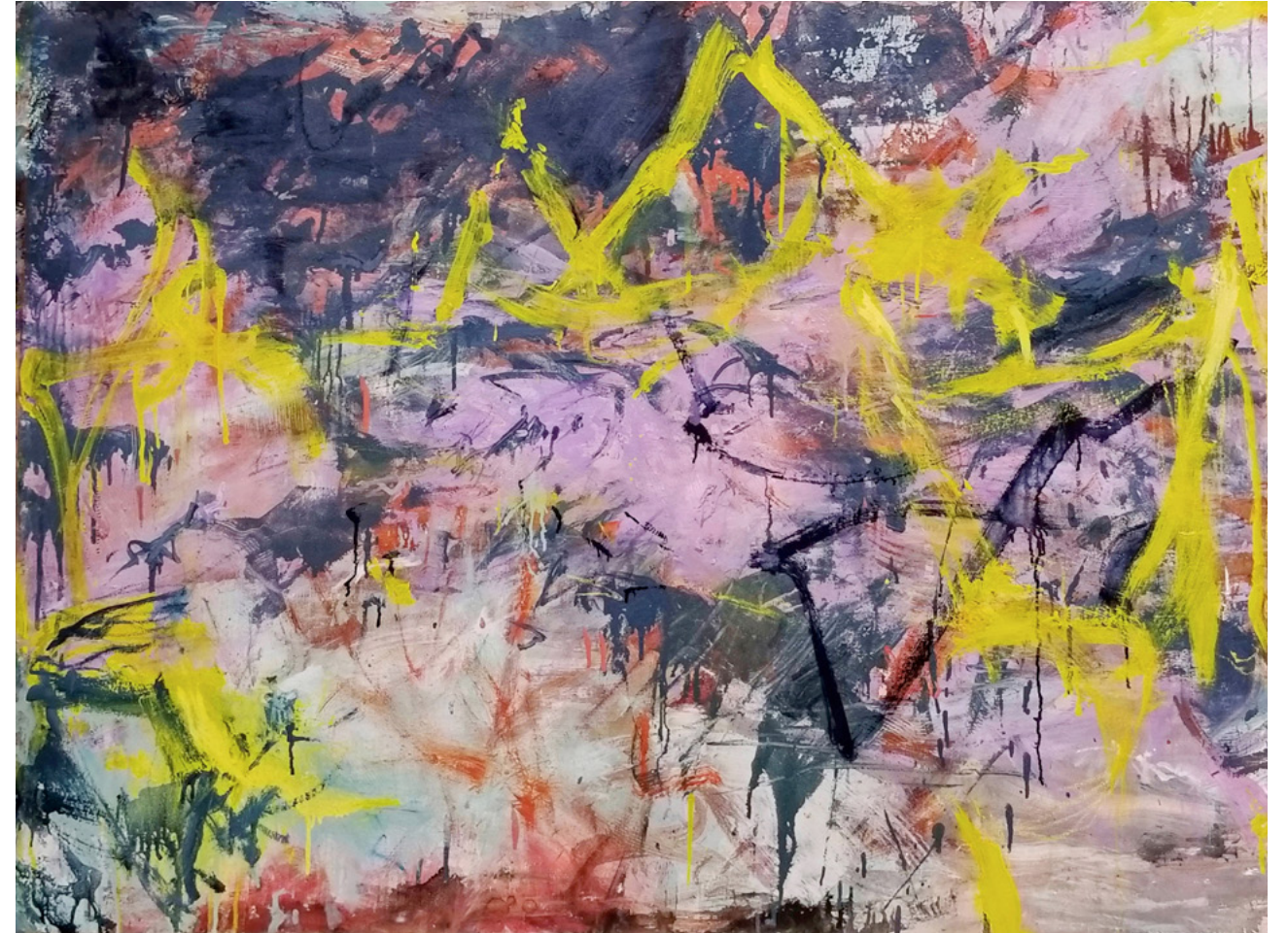
Yellow Triangles , 2019, Oil on canvas, 36" x 48"