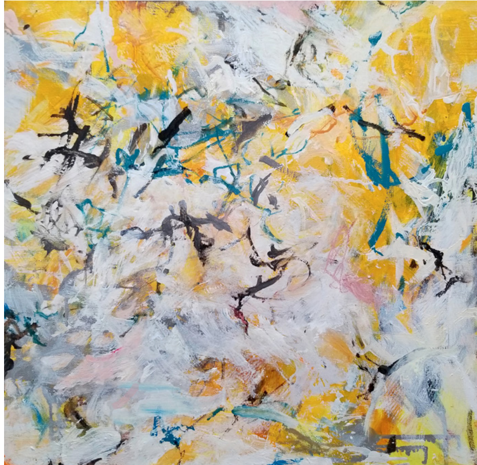
Flower Scribble 6, 2021, Oil on canvas, 20" x 20"