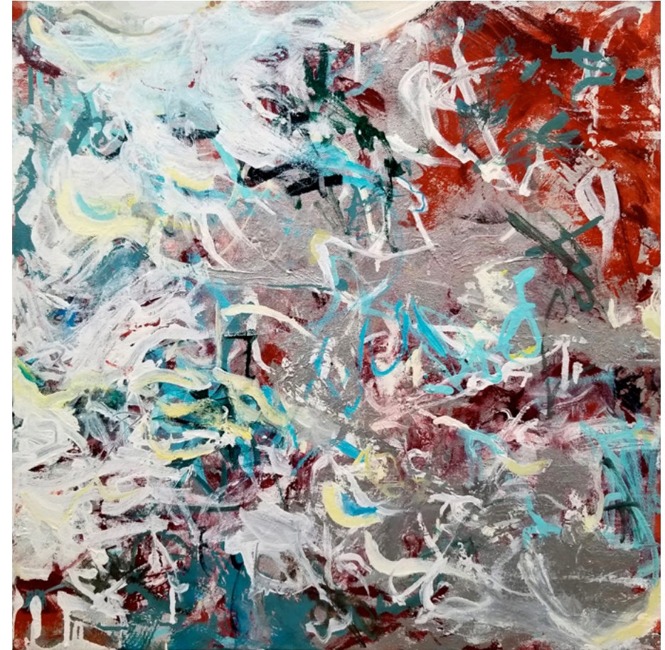
Flower Scribble 5, 2021, Oil on canvas, 20" x 20"